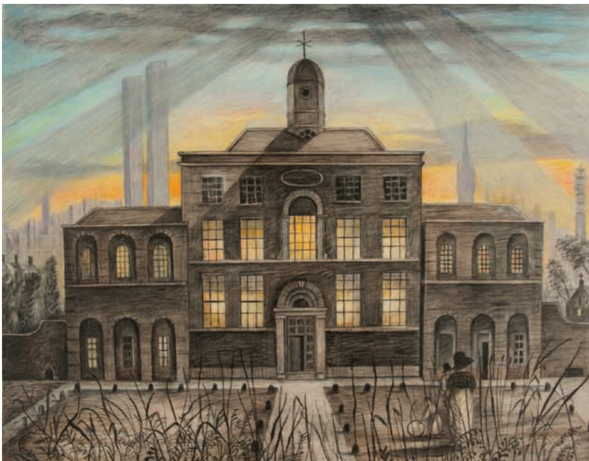
King's Cross and the Smallpox Hospital Gouache and mixed media 65 cm x 42 cm