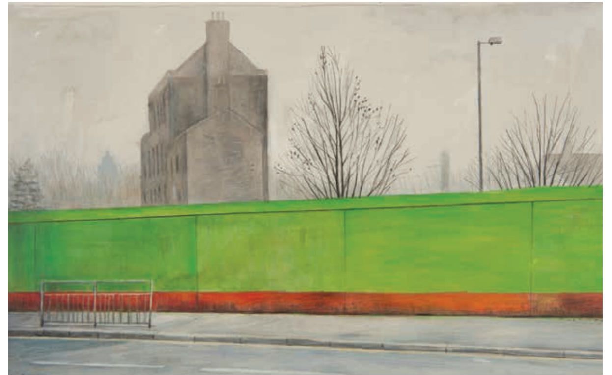
Coal and Fish Hoardings Crayon and gouache 28 cm x 45 cm