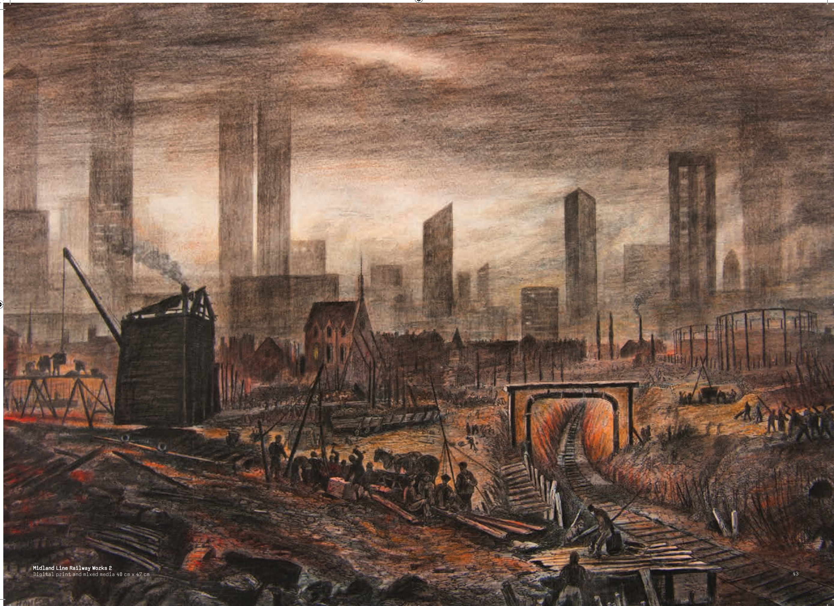
Midland Line Railway Works 2 Digital print and mixed media 40 cm x 47 cm