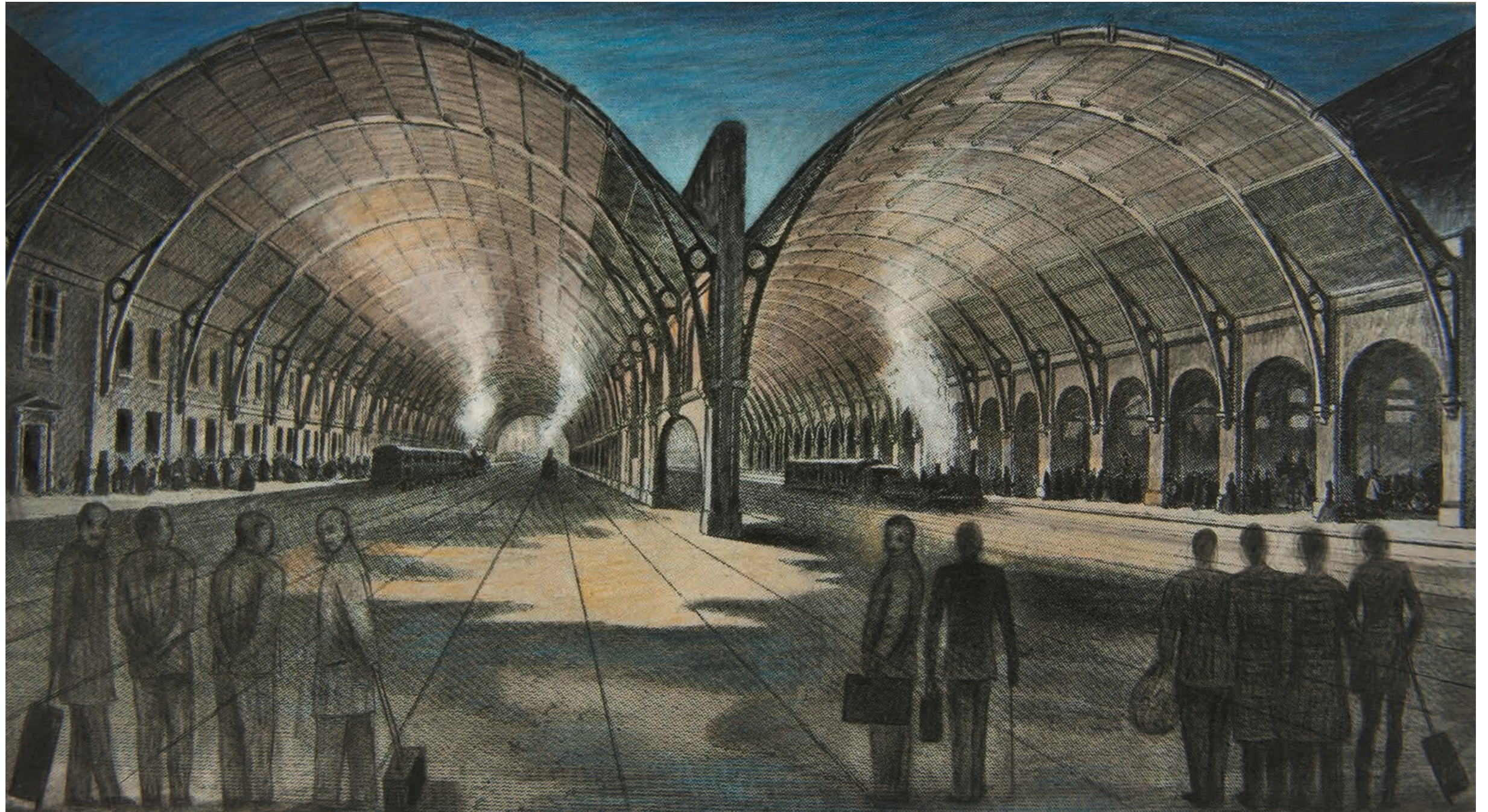
King's Cross Railway Shed Digital print, conte and crayon 30 cm x 55 cm