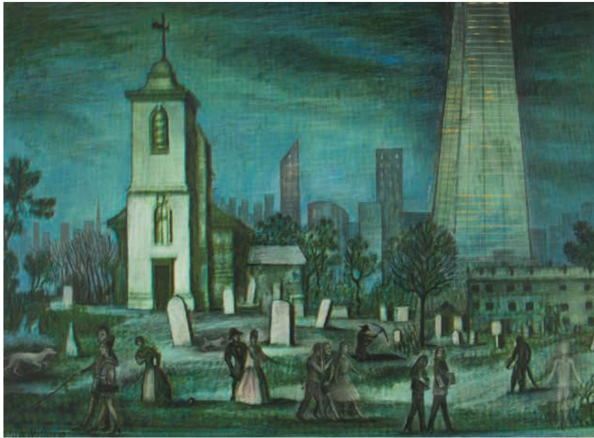
Celebrations of the Dead Digital print and mixed media 41 cm x 55 cm