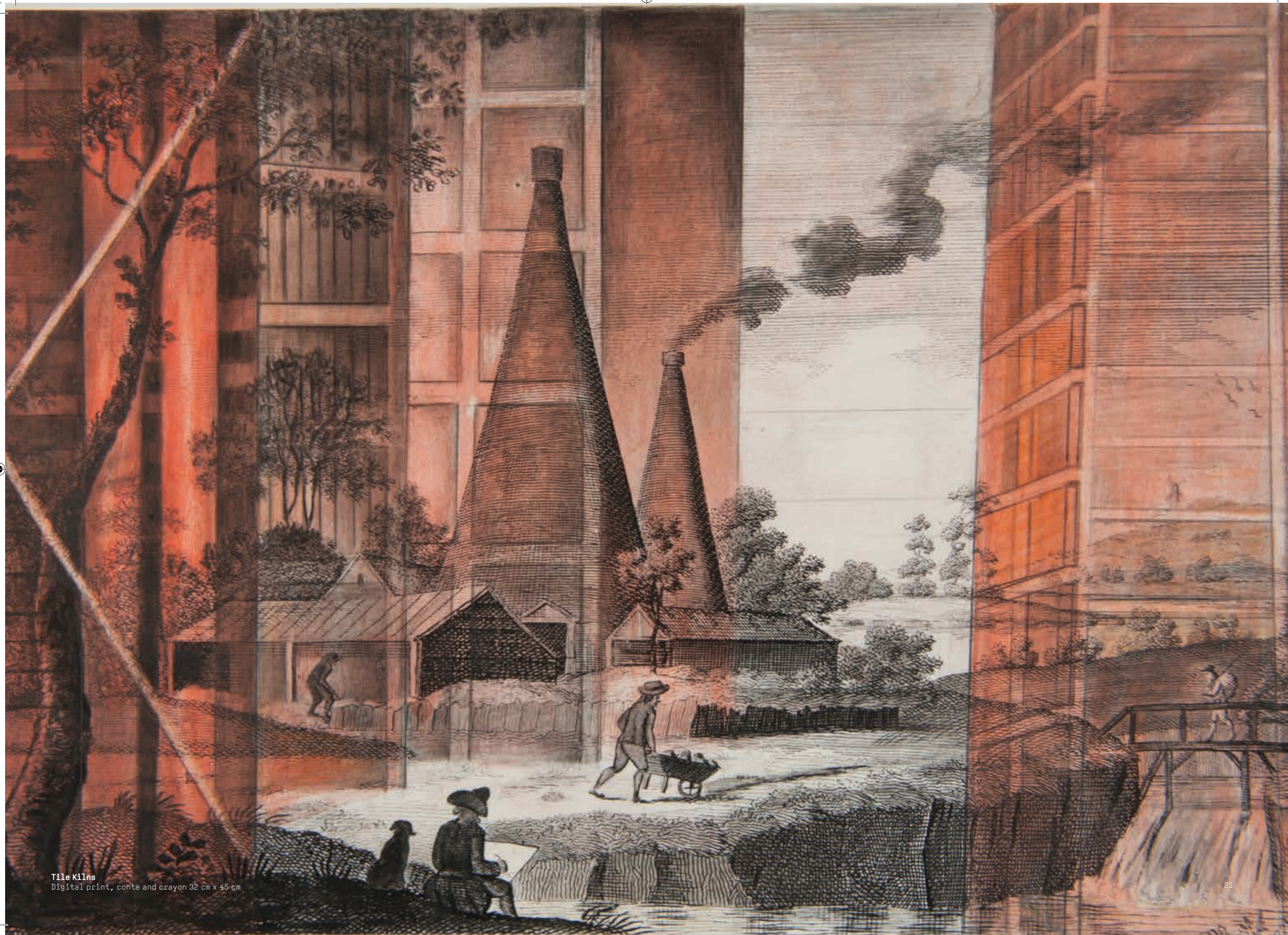
Tile Kilns Digital print, conte and crayon 32 cm x 45 cm