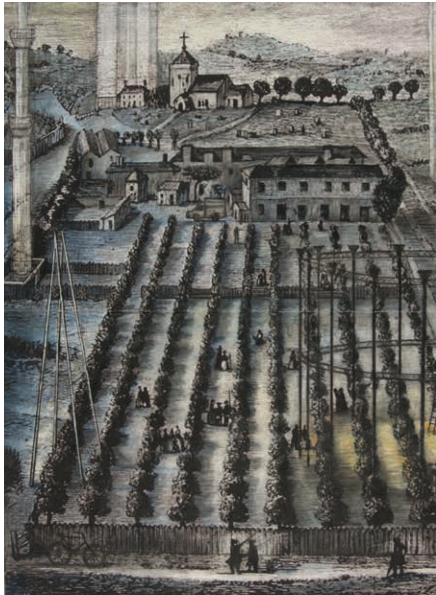
St Pancras Wells Digital print and mixed media 46 cm x 38 cm