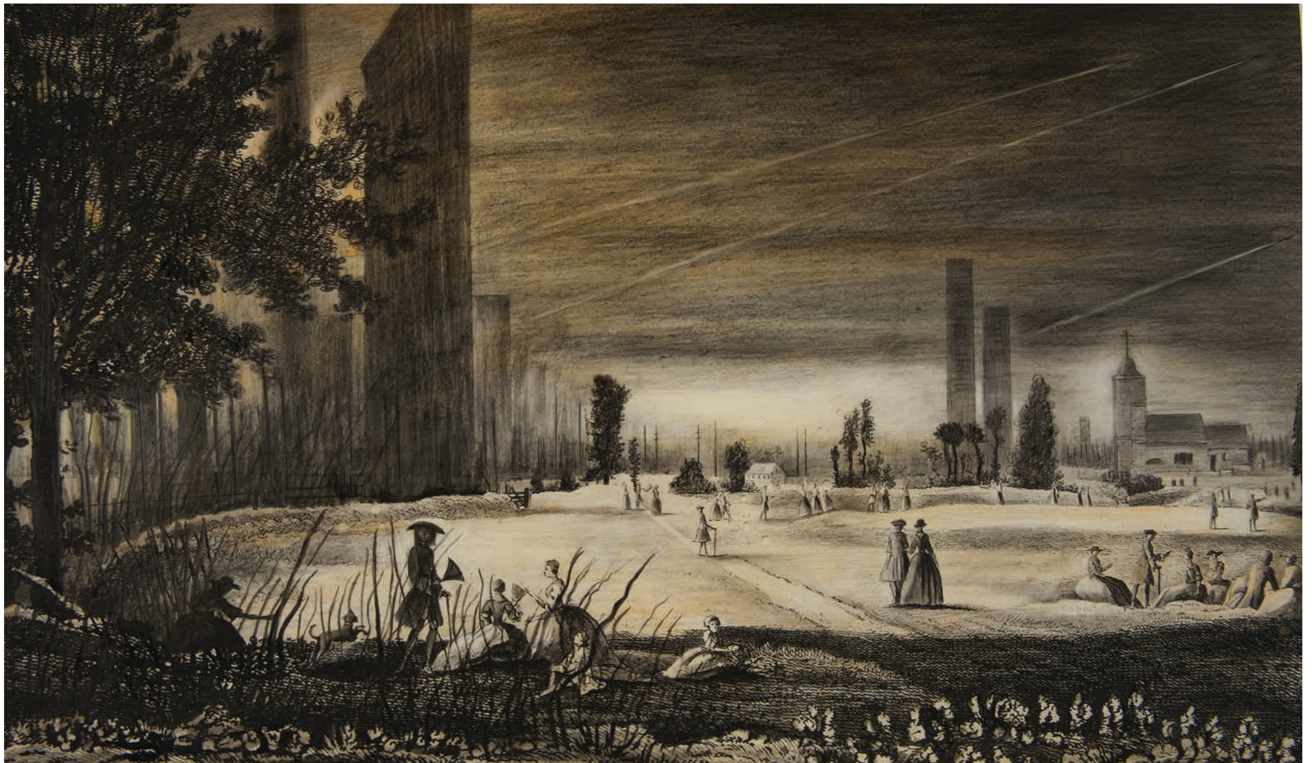
St Pancras in the Fields 1762 Digital print, gouache and carbon 36 cm x 57 cm