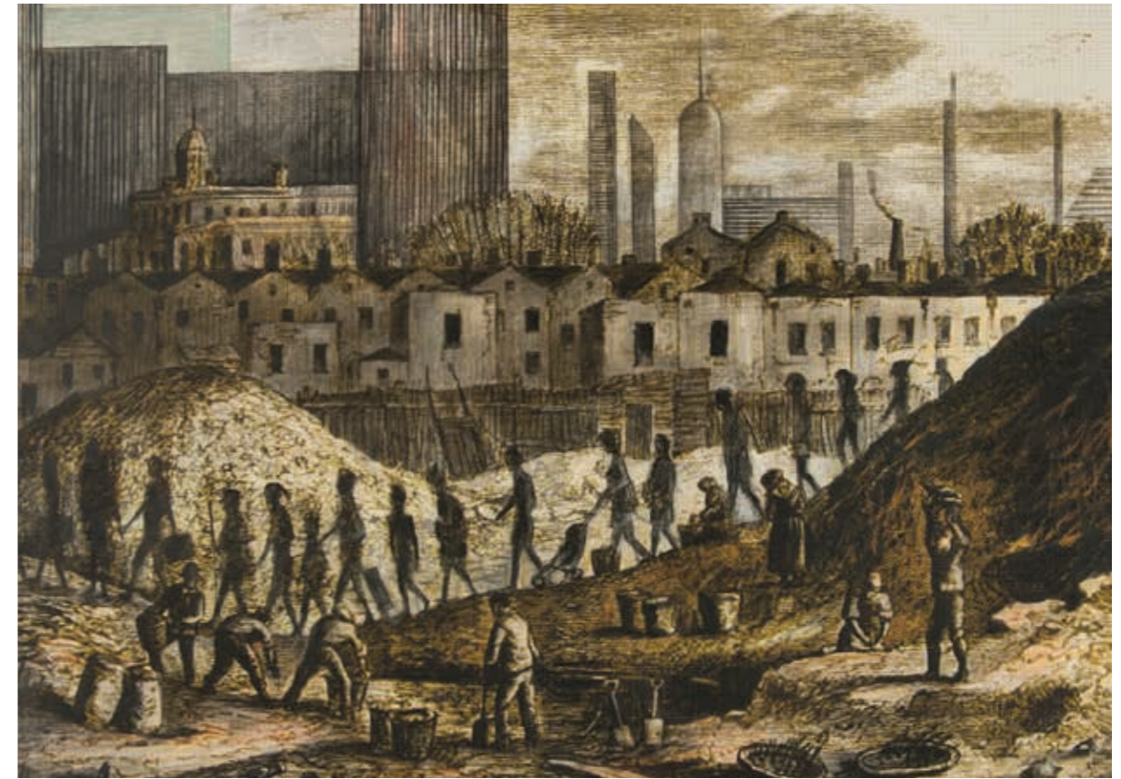
Dust Heap Digital print and conte 39 cm x 52 cm