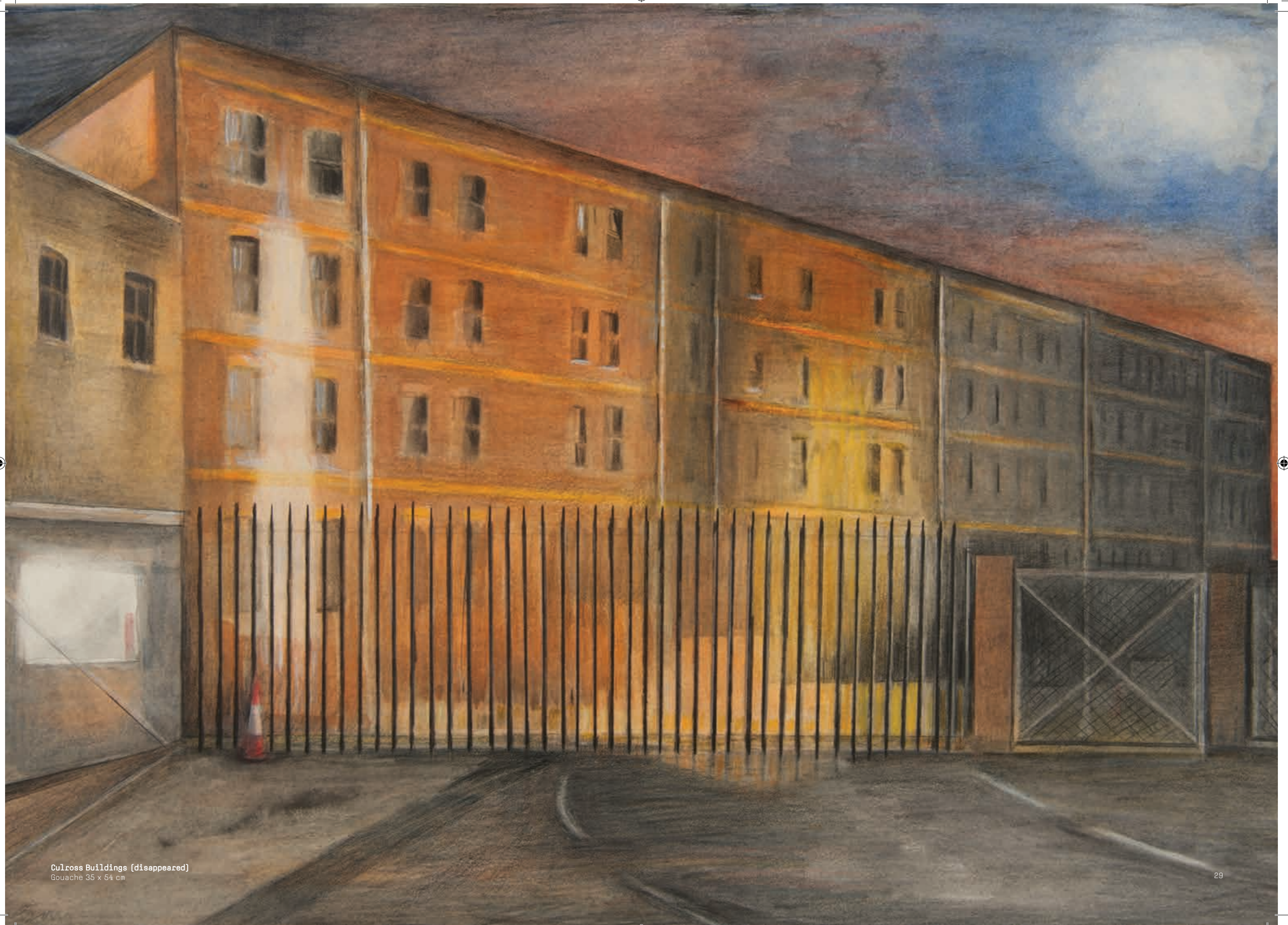
Culross Buildings [disappeared] Gouache 35 x 54 cm