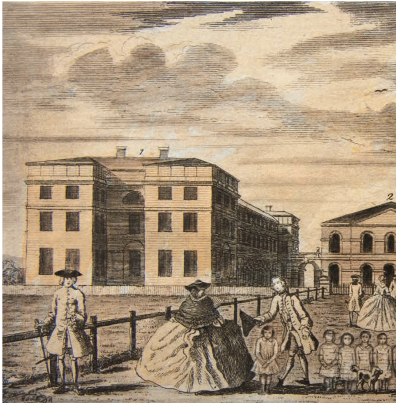
Foundling Hospital Digital print, conte and gouache 28 cm x 55 cm