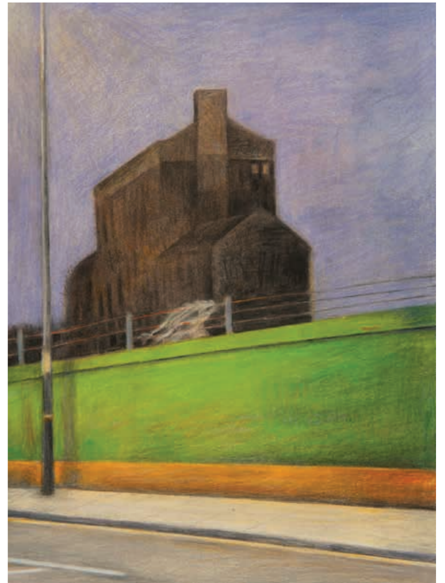
Coal and Fish Crayon and gouache 33 cm x 26 cm

is essential to their artistic and narrative success. If the works looked too much like a collage then the story they tell would probably not be greater than the sum of their parts. But this is not the case. The seamless assemblages invariably take the retained and added detail to a new level. With these images - that are commentaries on the London that was, is and will be - Howeson joins that intriguing band of artists who have not only chronicled London life but through their work added to our understanding and appreciation of the city. Sometimes these works are visionary, sometimes satiric but nearly always cautionary. As with Hogarth, Blake and Cruikshank, Howeson's works have compelling stories to tell.