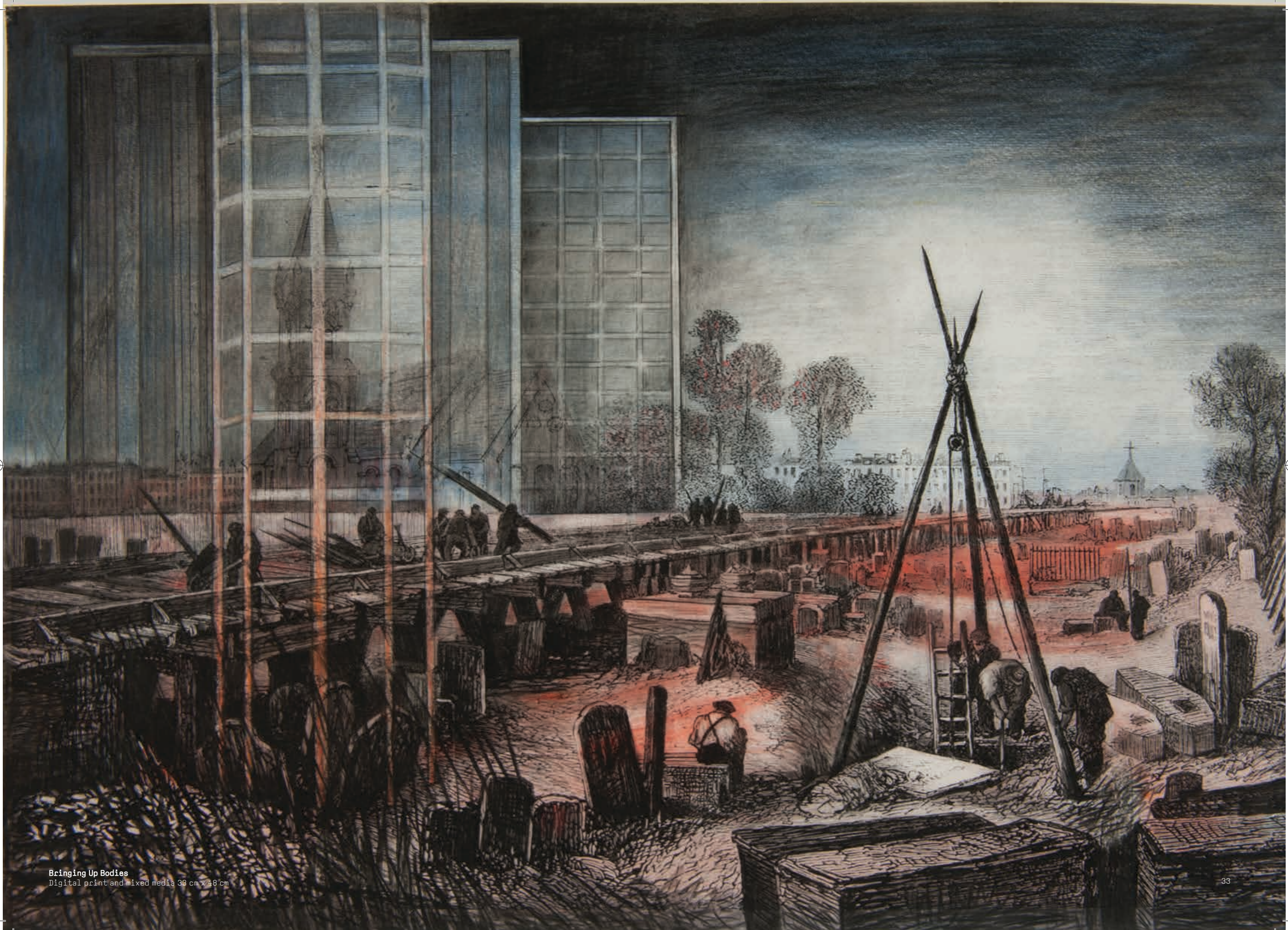
Bringing Up Bodies Digital print and mixed media 33 cm x 48 cm