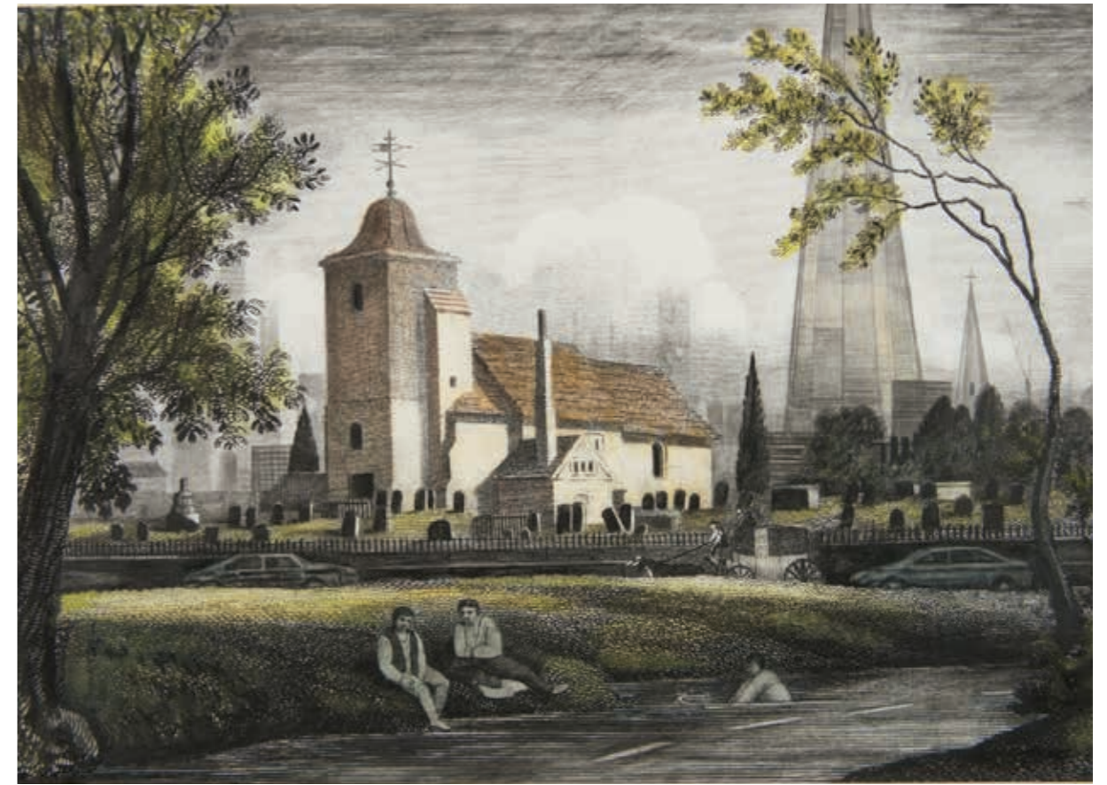
St Pancras Old Church and the Fleet River Digital print and mixed media 32 cm x 47cm