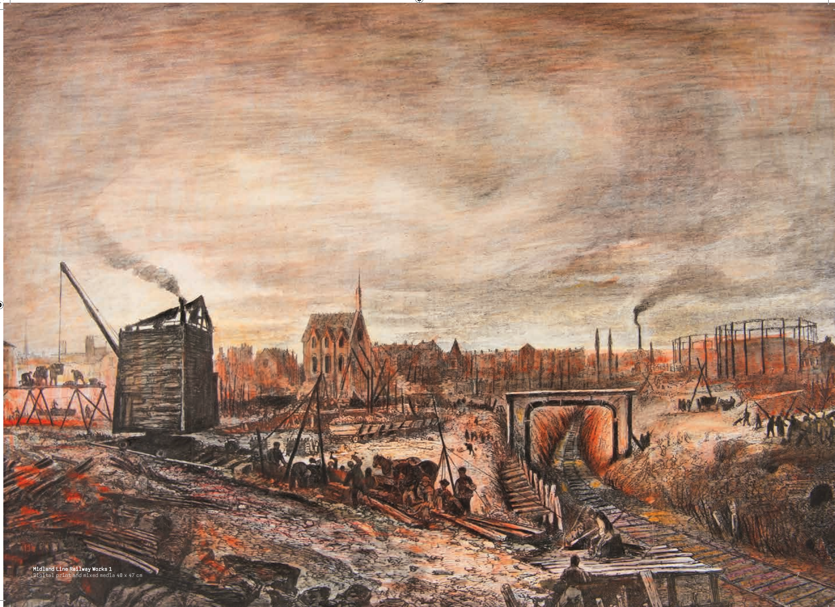
Midland Line Railway Works 1 Digital print and mixed media 40 x 47 cm