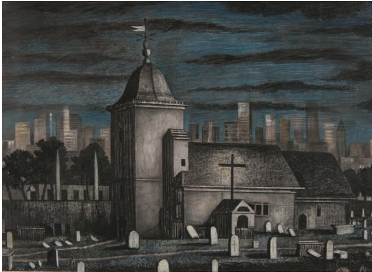
St Pancras Churchyard at Night Digital print and mixed media 32 cm x 45 cm