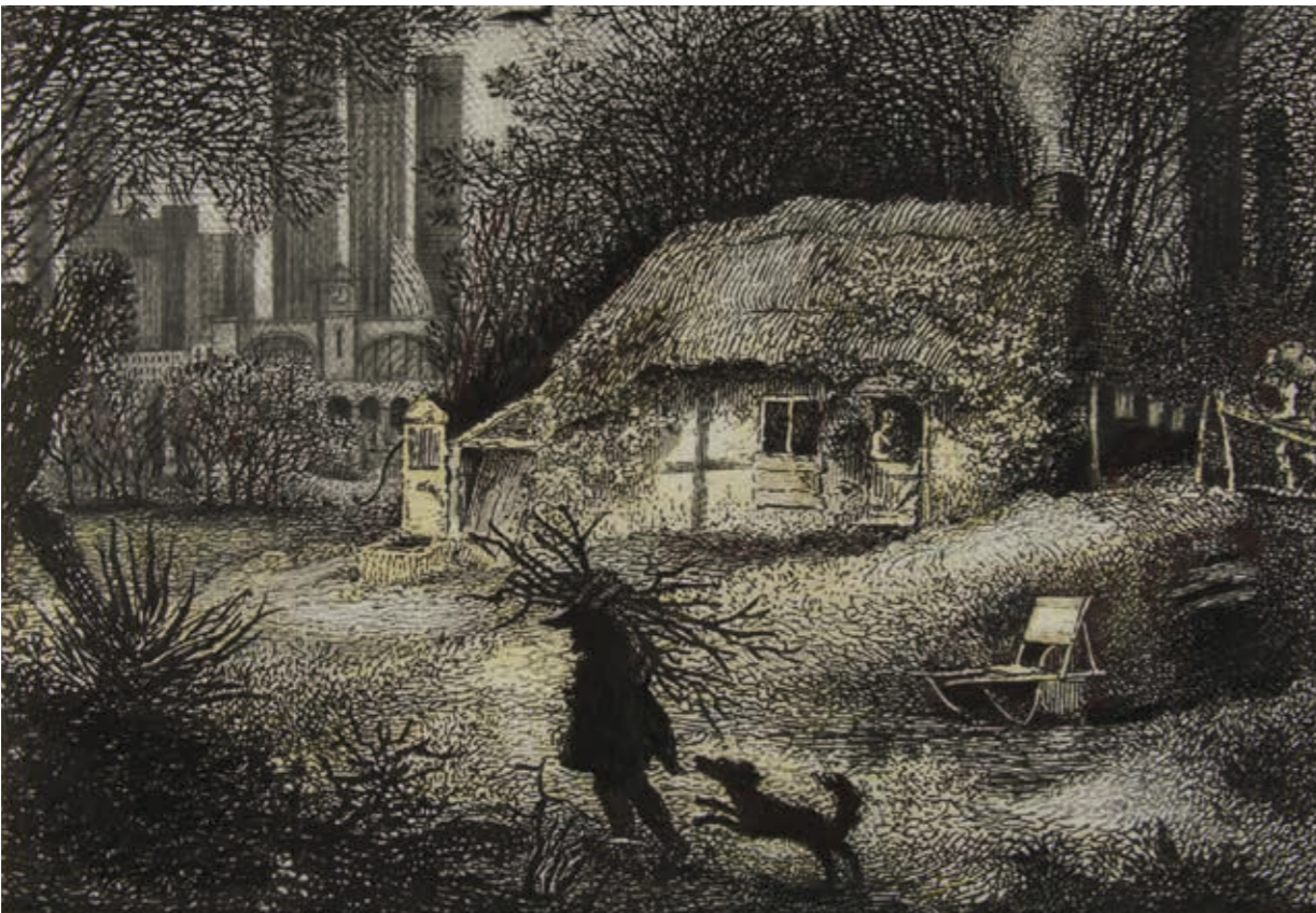
Battlebridge 1797 Digital print and carbon 42 cm x 56 cm