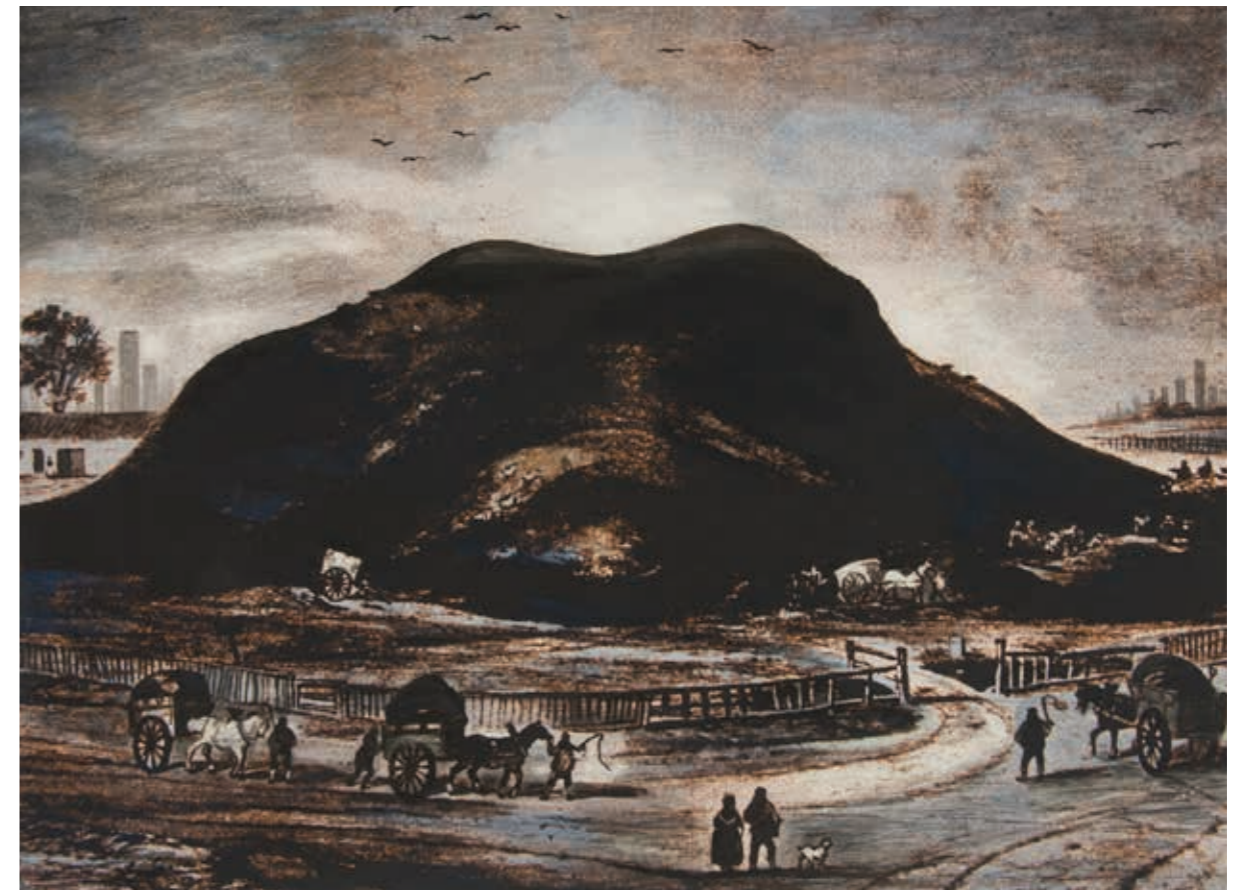
Dust Heap 1836 Digital print and conte 38 cm x 50 cm